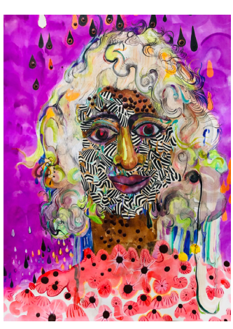
Maurizio Cattelan, Untitled, 2020; Katherine Bernhardt, Untitled, 2020; Rina Banerjee, Droplets and social decisions carpeted her expression, a distaste for isolation melted as survivors hypnotized by sickness both viral and racial climbed out of Central Park to change all Delusions and impressions, 2020

New York, NY... 2020: 100 Drawings from Now is an exhibition and benefit event supporting participating artists and The Drawing Center. Featuring drawings made by an international group of artists since early 2020, 100 Drawings from Now provides a snapshot of artistic production during a period of profound global unrest that has resulted from the ongoing health and economic crises, as well as a surge of activism in response to systemic racism, social injustice, and police brutality in the United States. Together, the works in the exhibition spotlight the urgency, intimacy, and universality of drawing during moments of upheaval and isolation.