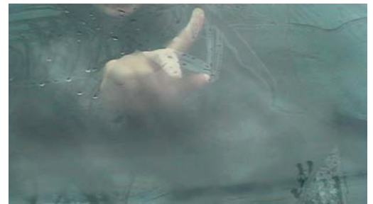
Terry Nauheim, Car Drawing , 2002, Still from digital film. Courtesy the artist.