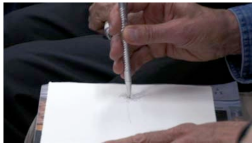
Candida Richardson, Underground Drawing by William Anastasi , 2008, Still from digital film.