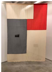
Hông-An Trương, Perilous Times in Four Texts , 2017. Silk screen on cotton voile, sound, and speakers, Voice over in collaboration with Ngọc Loan Trần, 60 x 84 inches.