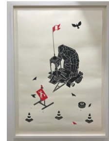
Olalekan Jeyifous, Imago Vi , 2017. Cardstock on watercolor paper, 44 x 30 inches.