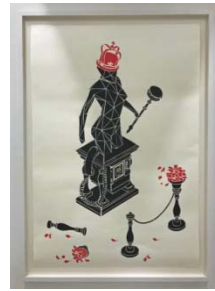
Olalekan Jeyifous, Parabola , 2017. Cardstock on watercolor paper, 44 x 30 inches.