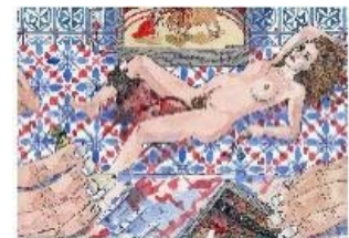
Jennifer May Reiland, Taurine , 2016. Watercolor and pen on paper, 7 x 10 inches.